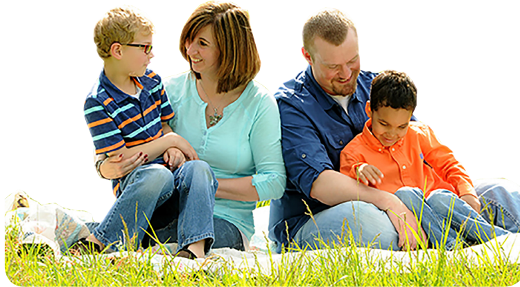
The Burgher family.

Wednesday, Aug. 8, 2018, 5:30 p.m. Veterans Memorial Park, St. Clair Shores